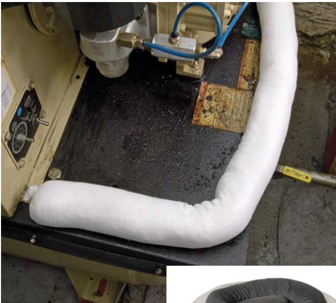
Oil Eater® Socks are available in both gray (universal) and white (oil only) styles.